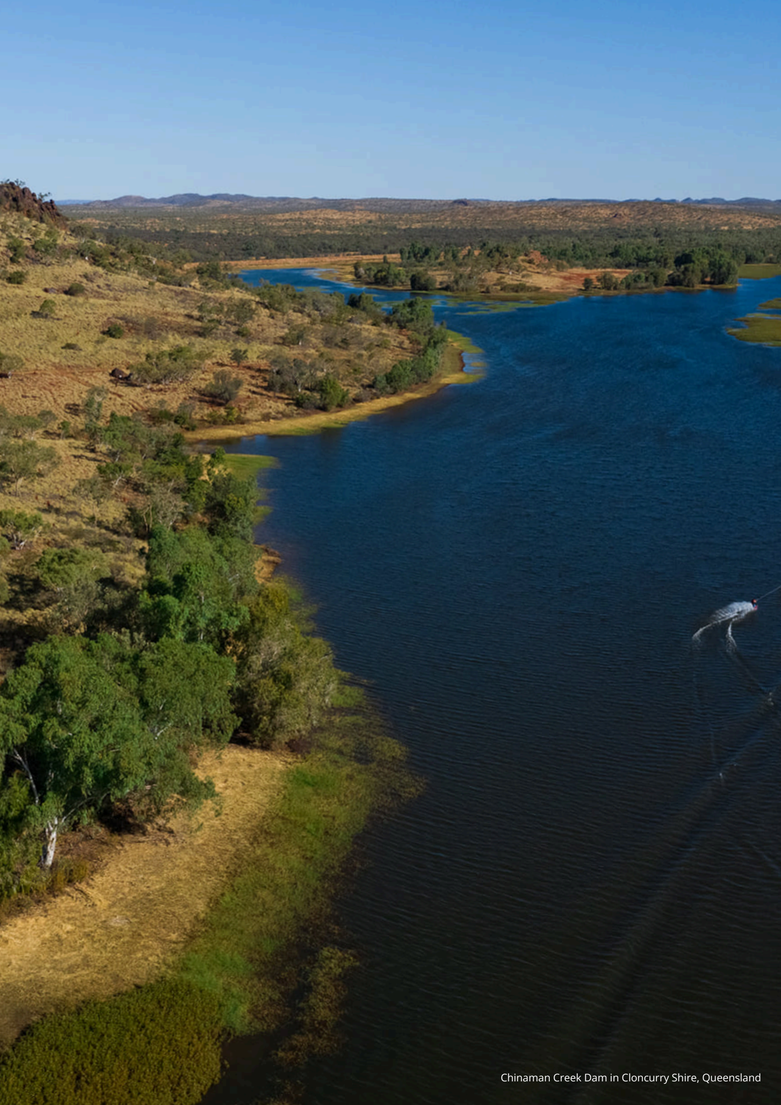
Chinaman Creek Dam in Cloncurry Shire, Queensland